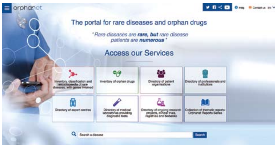
Figure 1 : Screen capture of the new look Orphanet website

Orphanet was founded by Dr. Ségolène Aymé, former Chair of the ESHG, in France at the INSERM (French National Institute for Health and Medical Research) in 1997. The initiative became a European endeavour from 2000, supported by grants from the European