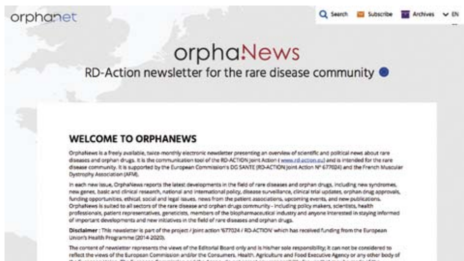
Figure 2 : OrphaNews newsletter

net and the ORPHA nomenclature are also cited as key resources in every European legislative text on rare diseases and as key measures in many national plans/strategies for rare diseases.