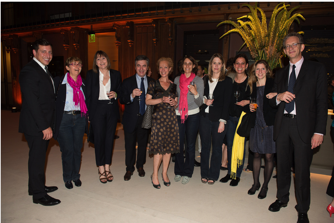
Representatives of the ESHG and French Society of Human Genetics enjoying the conference party.