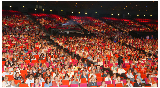
The Grand Amphithéâtre during the opening plenary.

The following nations do complete the top-ten list: The Netherlands: 203, Italy: 185, United Kingdom: 175, Germany: 174, United States: 144, Turkey: 119, Spain: 111, Belgium: 78 and Canada: 74 delegates.