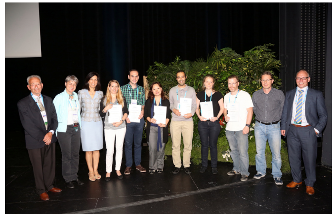
The 2013 ESHG Poster Award Winners and Finalists

Finally, it was also very nice to see entries from highly-talented school children who are very likely to win prestigious awards at international meetings in the future (such as that run by the ESHG). They all showed great potential to win an award such as the Young Investigator of the Year in the next 10 years, which will no doubt propel them to becoming research leaders of the future. Overall, I felt my whole experience at the meeting was superb and I look forward to attending more of them in the coming years!