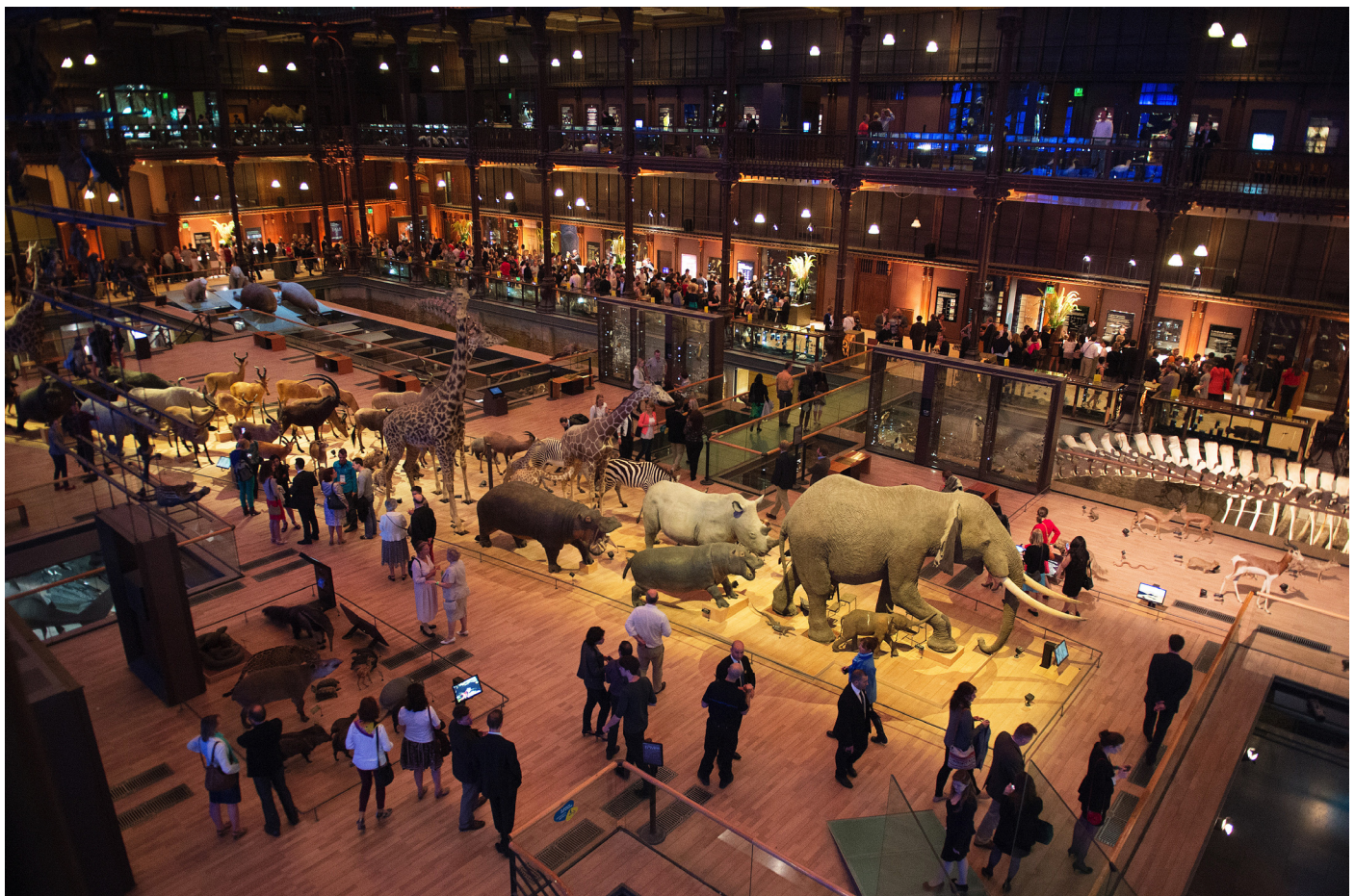
A total of over 900 persons attended the conference party in the Grande Galérie de l'Evolution.

Based on the peer reviewing process, 2.512 submissions were accepted for presentation, 126 in 20 concurrent sessions and one plenary, 1642 were eventually presented as a poster. The remainder was accepted for publication in the electronic abstract supplement of the European Journal of Human Genetics.