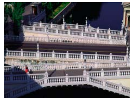
Three Bridges Ljubljana

Since 2004, laboratories have to be authorized by the Ministry of Health to carry out analyses in the field of laboratory medicine (64/2004). Some laboratories take part at the Cytogenetic European Quality