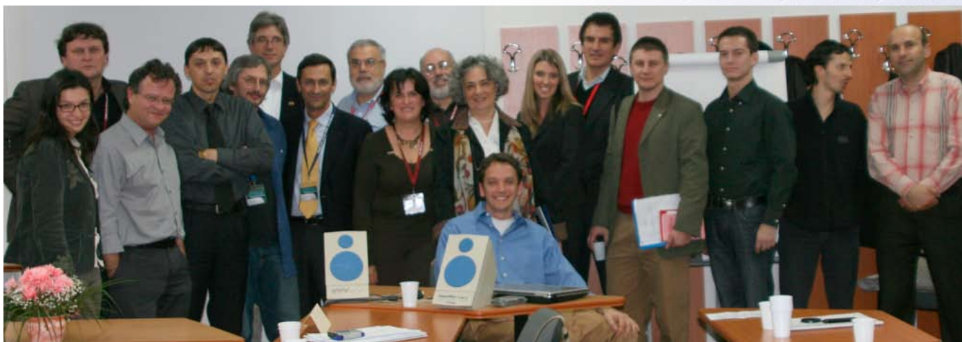
Group picture of participants at the Meeting "New Frontiers in Evidence Based Psychology" Cluj-Napoca, Romania, 7-9 November 2008.